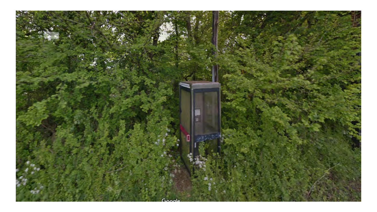
Usage (last 12 months): 0

PARISH: Ellingham Harbridge and Ibsley Parish Council