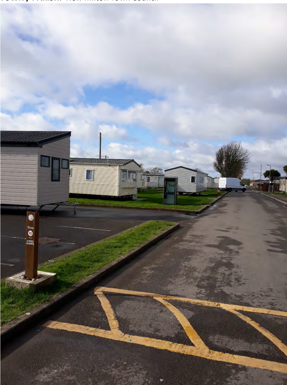
Usage (last 12 months): 8

Accident Provision: No road-traffic incidents reported close to this site (Crashmap.com)